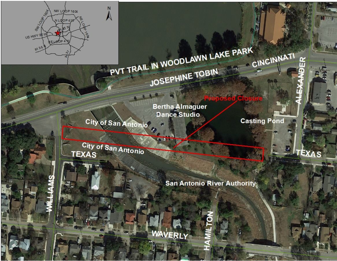
Aerial Map of Proposed Closure